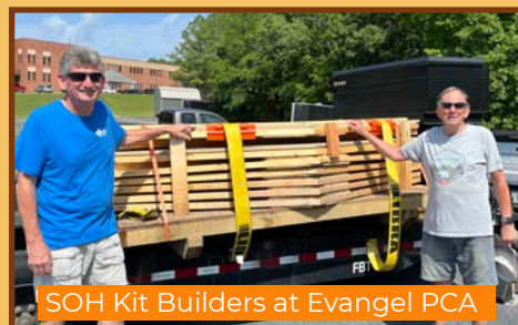
SOH Kit Builders at Evangel PCA