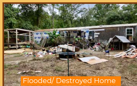
Flooded/ Destroyed Home