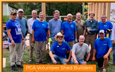
PCA Volunteer Shed Builders