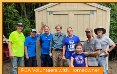
PCA Volunteers with Homeowner

"For we know that if the tent that is our earthly home is destroyed, we have a building from God, a house not made with hands, eternal in the heavens." — 2 Corinthians 5:1